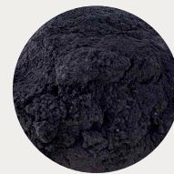
Unroasted Molybdenum Concentrate