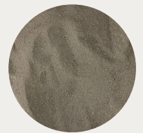
Roasted Molybdenum Concentrate (Oxide Powder)