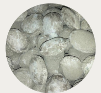
Roasted Molybdenum Concentrate (Briquettes)